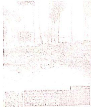
Dumping of Solid waste adjacent to Bangaru Canal connecting Chembarambakkam lake